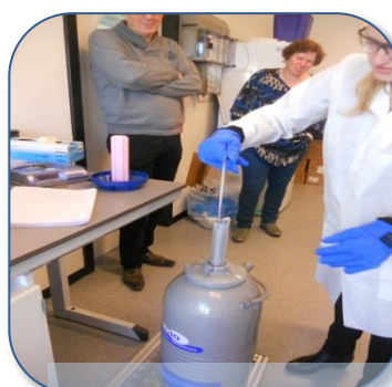
Testing of products at WHO designated testing laboratories according to WHO harmonized testing protocols