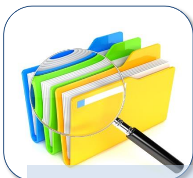
Review of product dossier by WHO and IAC, including existing testing data and product information on safety, performance and field testing